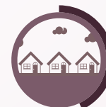
Poverty rates by area 2018