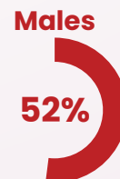
Poverty rates by sex 2018