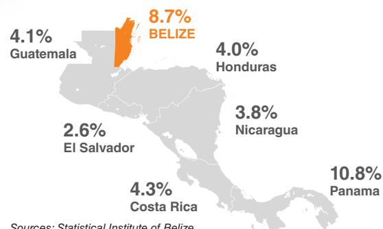
Fig. 3.0: Annual GDP Growth Rates (constant prices) of Central American Countries, 2022