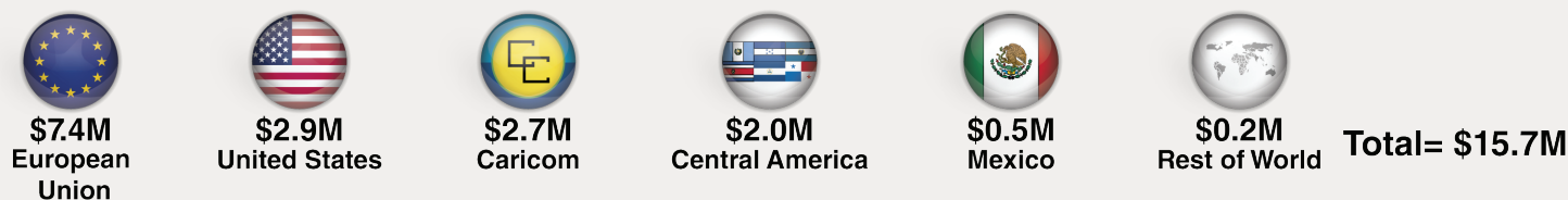
Figure 4: Composition of Exports by Destination; December 2017 (Millions of BZ Dollars)

Accounting for a third of Belize's total exports for the year 2017, sugar emerged as the country's top export earner, as revenues from that commodity rose by 43.6 percent or nearly $45 million from $103.1 million in 2016 to over $148 million in 2017. While exported quantities for this product rose by almost 27 percent compared to the previous year, this increase in revenues also reflected more favourable world market prices for sugar during the year. Likewise, bananas performed strongly throughout 2017, recording a 17 percent increase in export earnings over that of 2016 as revenues went up by $11.9 million, from $69.9 million in 2016 to $81.8 million in 2017. Annual crude petroleum earnings were virtually unchanged compared to 2016, notwithstanding a 20.3 percent drop in exported quantities, as revenues were bolstered by more favourable world market prices in 2017. Exports of marine products fell slightly from $41.9 million in 2016 to $40.1 million in 2017, as greater sales of lobster tails and lobster meat partially offset the drop in shrimp and conch exports. In 2017, citrus exports declined steeply by $19.6 million, from $100.1 million to $80.5 million, as sales of orange concentrate for the year were significantly lower than they were in 2016.