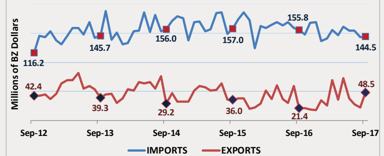
Figure 2: Composition of Gross Imports by Type; September 2017