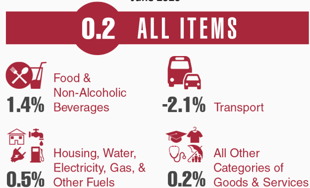
Figure 2: Inflation Rates by Major Categories; June 2020