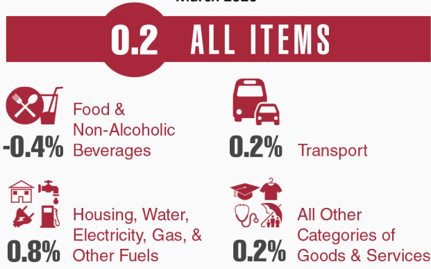
Figure 2: Inflation Rates by Major Categories; March 2020