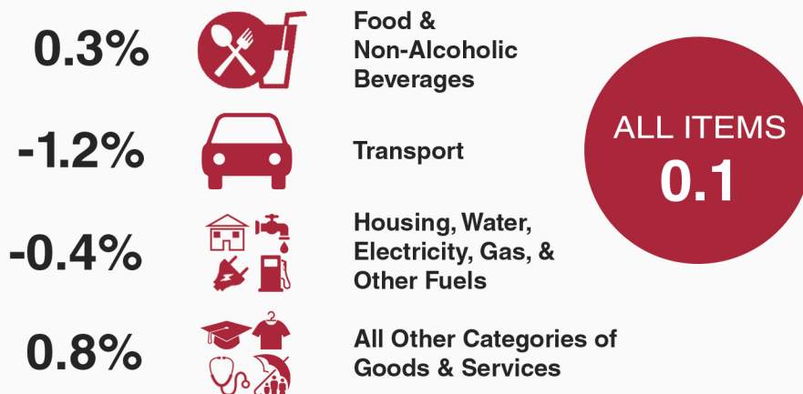
Figure 2: Inflation Rates by Major Categories; February 2019

Despite increases in international airfares and the cost of maintenance and repairs of personal vehicles, the 'Transport' category recorded an overall decrease of 1.2 percent for the month of February 2019 when compared to February 2018 (see Figure 2). This was mainly due to decreases seen in the 'Fuel and Lubricants' sub-category, which saw prices going down by 3.4 percent when compared to the same month of last year. Fuel prices began to see a decline in December 2018, after having trended steadily upwards for almost two years. At the pump, the average price per gallon of Premium gasoline went down by 10.4 percent from $11.46 in February 2018 to $10.27 in February 2019, while Regular gasoline declined by 6.6 percent from $10.29 to $9.61, and Diesel fell by 1.4 percent from $10.12 to $9.98 (see Table 1).