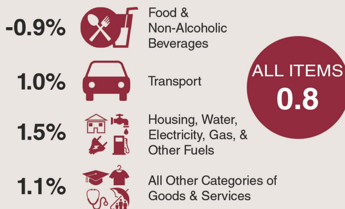
Figure 2: Inflation Rates by Major Categories; October 2018