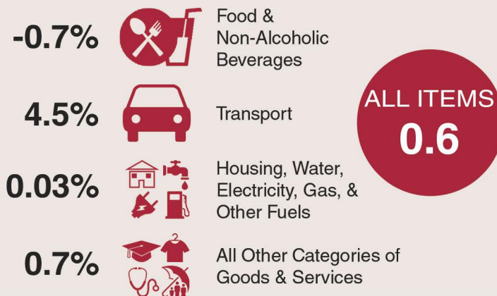
Figure 2: Inflation Rates by Major Categories; June 2018