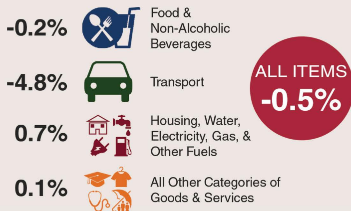
Figure 2: Inflation Rates by Major Categories; April 2018