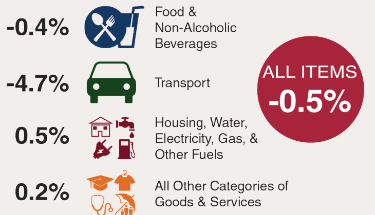
Figure 2: Inflation Rates by Categories; February 2018