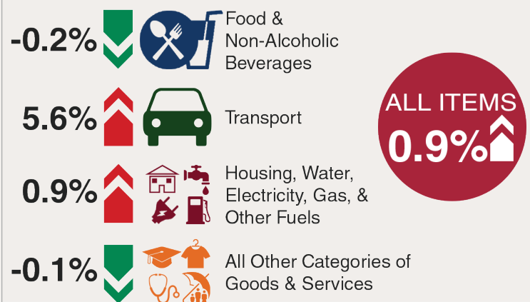
Figure 2: Inflation Rates by Categories; January 2018